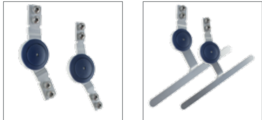
Bar Adapter - Straight or w/T-Bar