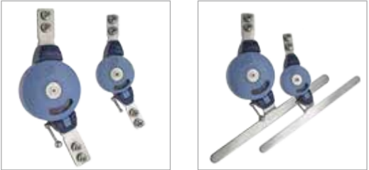
Bar Adapter - Straight or w/T-Bar