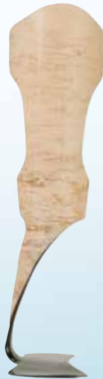
BIRCH Classic natural pattern blends with various wardrobe options.