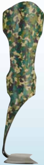
NEW! CAMO Stylish camouflage pattern.