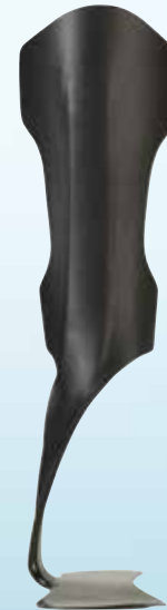
BLACK Sophisticated matte black provides a soft chic look and feel.