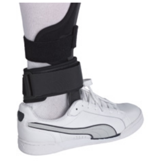
For Pes Valgus Control