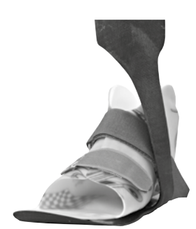
KiddieGAIT® with Surestep™