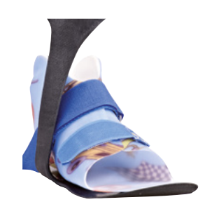
KiddieGAIT® with SMO

KiddieFLOW<sup>™</sup>, KiddieGAIT<sup>®</sup> and KiddieROCKER<sup>®</sup>should always be combined with an additional orthotic, designed to control the position of the foot.