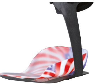
KiddieGAIT® with UCB