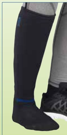
Pull the sleeve onto the leg, like a tube.

CoverKIT™ 2.0 combines our SoftKIT™ interface with a thin textile front to form a sleeve that slides over the anterior shell.