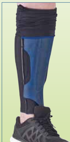
At this stage, if needed, put the vertical pads inside the brace. Put the brace in the shoe. Press it towards the sleeve and pull the sleeve over all the way down. For increased stability use the regular straps for your Allard AFO.