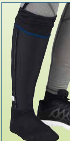
Grab the outer layer with the blue seam and pull up to the knee.