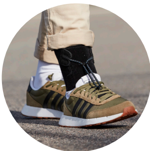
The D-ring holds the straps together.

ToeUP™ includes a forefoot wrap that may be used to attach the elastic cord when not wearing shoes or unlaced shoes, such as sandals.