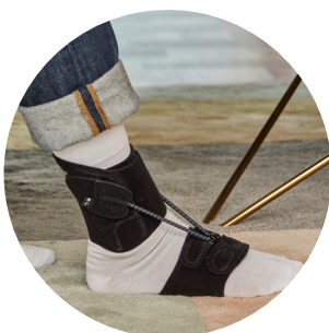
Forefoot wrap for indoor use or with unlaced shoes.