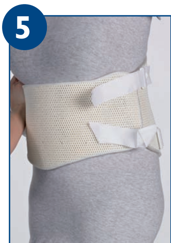
Mold front to patient