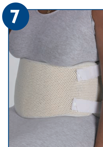
Check the fit