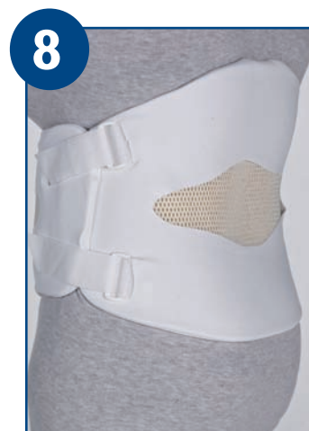
Apply optional soft liner/cover