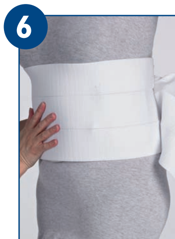
Secure with abdominal binder or elastic wrap